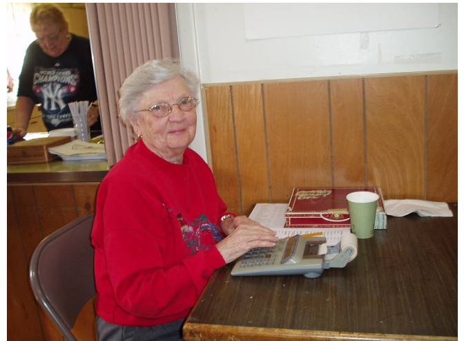
THESE PICTURES SHOW PART OF OUR KITCHEN CREW, THE WORKERS IN THE WHITE ELEPHANT ROOM AND YOUTH